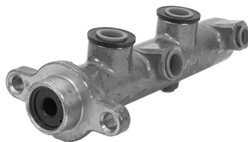
10-4007 (1.125" bore)

For 10-2690 (with cruise) upgrade to 10-2828.